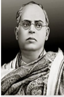
Dwijendra Lal Roy